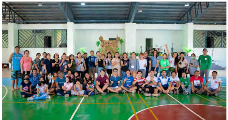
OFI and OBFI Staff in one frame