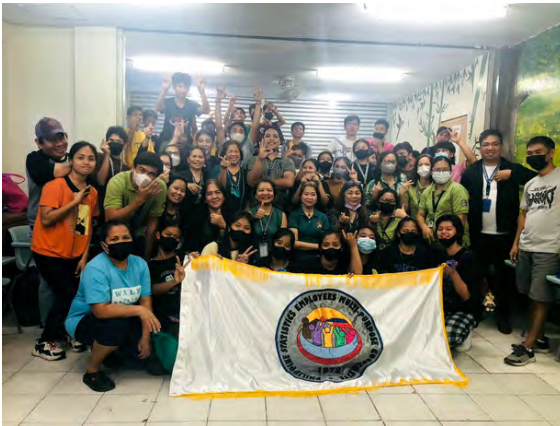
Phil. Statistics Authority Multi-Purpose Cooperative