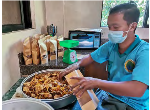
New By-Products: Banana Chips fresh from the Farm