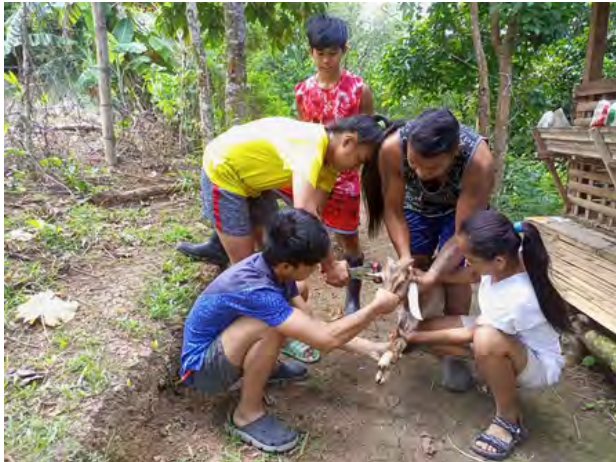
5th Batch of our 3-Month Vocational Farm Training