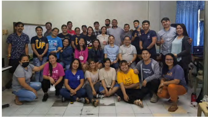
Our International Coordinator together with Onesimo staff