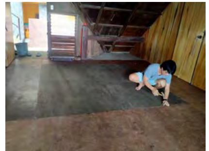
Big house flooring repairs