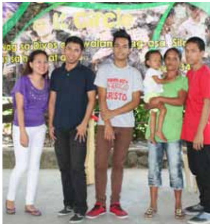
Client with his family, social worker and house parent