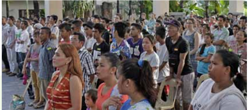
Just part of the large appreciative crowd.

performed complete with Filipino costumes and Native Pinoy outfits. Games were also Filipino games. Even the Discovery Team sang a Tagalog melody. The whole crowd which came inspite of the rainy weather enjoyed the celebration, songs, dances, games.