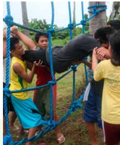
Clients going through a team-building exercise