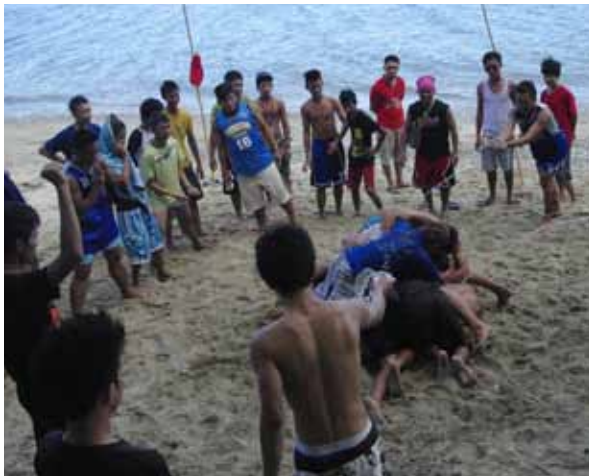
Campers at play

The greatest challenge to the youth nowadays is surrendering their lives to Jesus, the true friend and companion. This would lead them to a righteous path. A life with Him could alone give us the peace and true love that the youth are looking for.