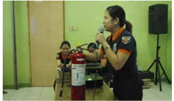
Explaining the use of fire extinguisher

It is important for each and every individual most especially for the youth to be aware of how drug abuse can affect our lives. The Philippine Drug Enforcement Agency facilitated the Drug Abuse Seminar last July 22 and 25, 2014 at Onesimo Foundation. The seminar was attended by Onesimo clients and staff. Some of the attendees participated actively, asked questions and shared their experiences about the topic.