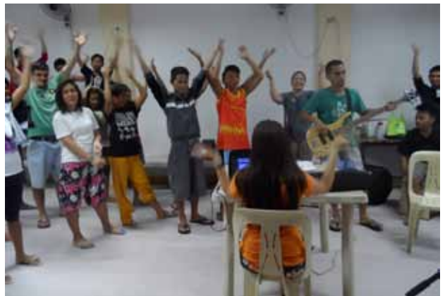
Dancing and singing together