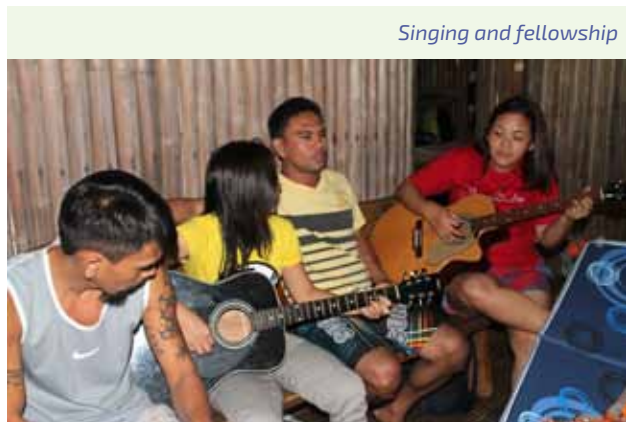
Singing and fellowship