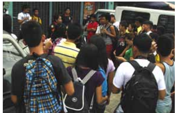
Recap and commentary after the fire drill

Onesimo held a fire drill last October 7, 2014. The drill was participated in by the clients and staff and facilitated by the Fire Officers from Bureau of Fire Protection. The facilitators shared their knowledge on how to prevent fire, how to use fire related equipment and on how to be knowledgeable in putting out different types of fire. After the instruction Fire Officers were designated among the staff. The fire drill was conducted immediately after.