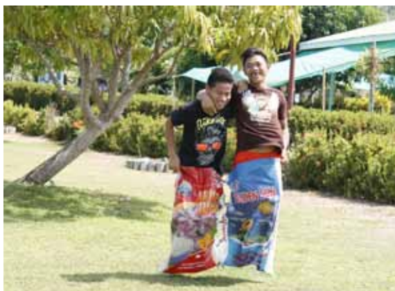
Residential youth playing games

Many of the families experienced healing and forgiveness.