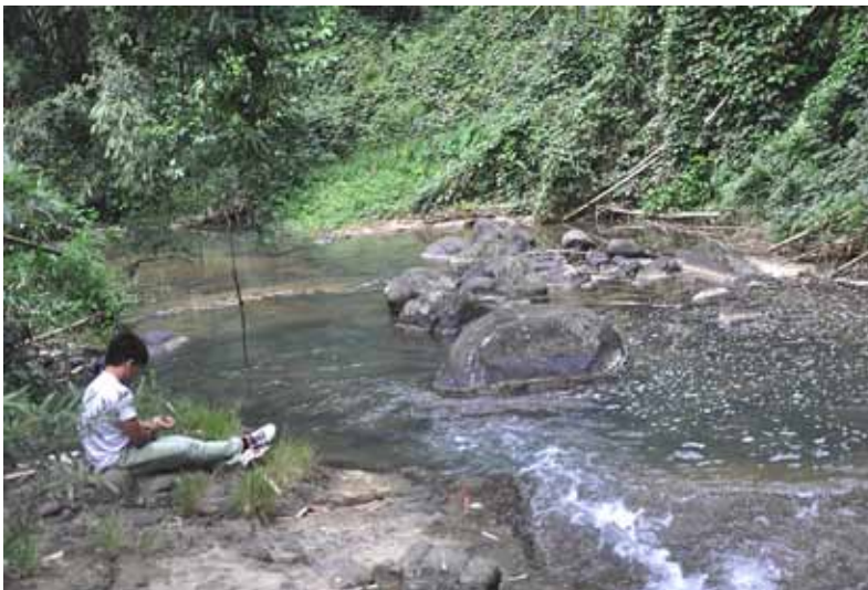
The stream alongside the campsite.