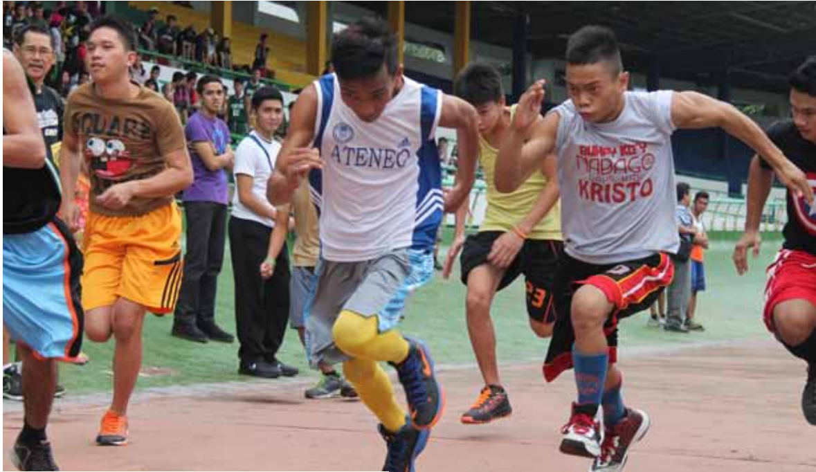
Giving it their best for Christ!

Our Annual Sports Fest last November was a 6-day event participated in by Church-Based and Residential Youth. For the first time we were able to add track and field events as additional sports. Our theme was "OFI Strengthening Fellowship". A total of 396 delegates came and participated in the Sports Fest which was held at the Amoranto Sports Complex in Quezon City. The sports they competed were Basketball, Volleyball, Table Tennis, Dart, Chess, Badminton and Track and field. We also added some Filipino games and bonding time with some girls at CBM and Residential youth during free time. For the first time track and field was done in 100, 200, 400m, 800m, 1500 and 3000 meter run both in men's and women's divisions. We also had shot put and discus throw.. Additionally we personalized our Onesimo medals this year so the winners were doubly happy and proud of their achievements.