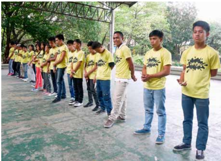
New trainees all ready for a newer and better life experience