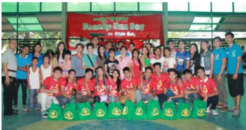
A great day capped by gift bags. Onesimo kids, families, pastors and workers together