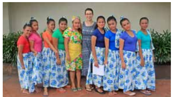
Girls from Mendez Center show off their native costumes.