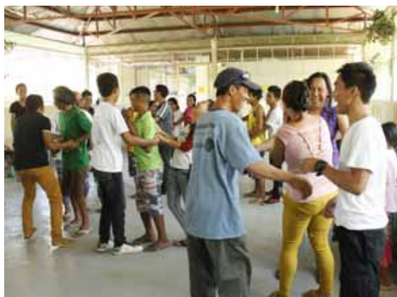
Parents and children in fellowship and camaraderie.