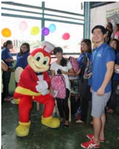
Residential Client receiving a gift backpack from Jollibee and Wills Corporation staff

The event was held at the 3rd floor of the Onesimo building. 44 clients received gift bags and a small amount of cash each. The President and key personnel of Wills joined Onesimo staff and clients in a wonderful celebration. The company also donated a check worth P50,000 to further the work of Onesimo.