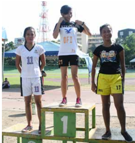
The sweet smile of triumph

Our Annual Sports Fest last November was a 6-day event participated in by Church-Based and Residential Youth. For the first time we were able to add track and field events as additional sports. Our theme was "OFI Strengthening Fellowship". A total of 396 delegates came and participated in the Sports Fest which was held at the Amoranto Sports Complex in Quezon City. The sports they competed were Basketball, Volleyball, Table Tennis, Dart, Chess, Badminton and Track and field. We also added some Filipino games and bonding time with some girls at CBM and Residential youth during free time. For the first time track and field was done in 100, 200, 400m, 800m, 1500 and 3000 meter run both in men's and women's divisions. We also had shot put and discus throw.. Additionally we personalized our Onesimo medals this year so the winners were doubly happy and proud of their achievements.