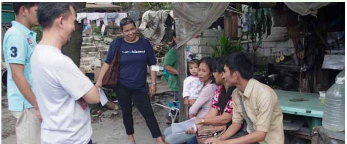
Instructional Managers in community