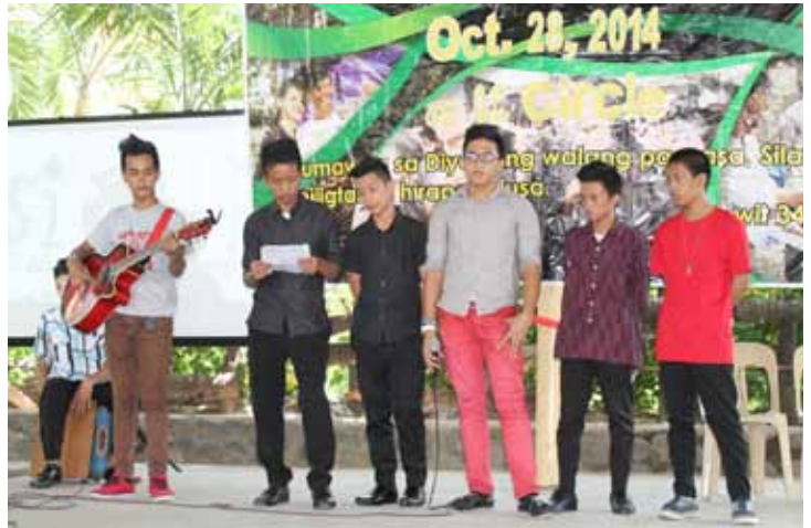
Tondo Center clients singing