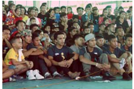
Mesmerized by the "magic" show