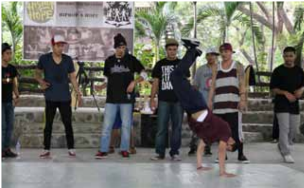
A dancer showing off his wares!

Hip Hop 4 Hope plans a larger outreach event next year with more international participants for the benefit of Filipino Youth at Risk and Slum kids.