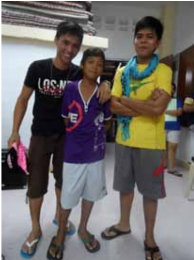
Two elder clients with a younger trainee

13 boys and 6 girls decided to continue with the program and joined the elder clients at the residential centers.