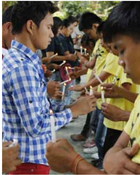
Staff and volunteers light candles symbolic of the Holy Spirit and transfer them to the newly accepted trainees.

The trainees begin the six-month All Of Life discipleship training which is the next major phase of their new life and commitment.