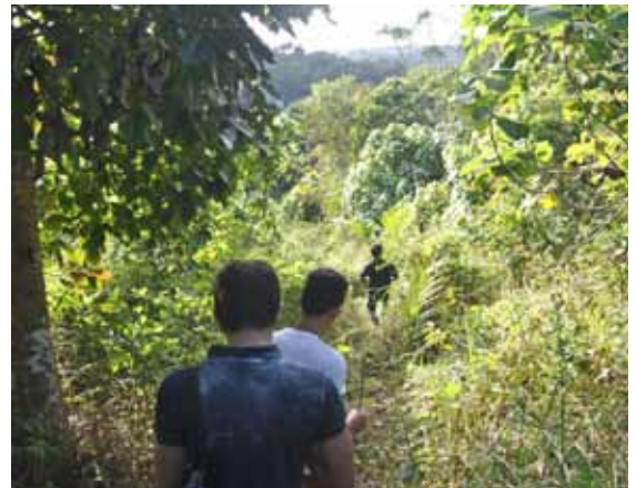
Cool breezes, trees and vegetation greet CBM workers on their visit to the place