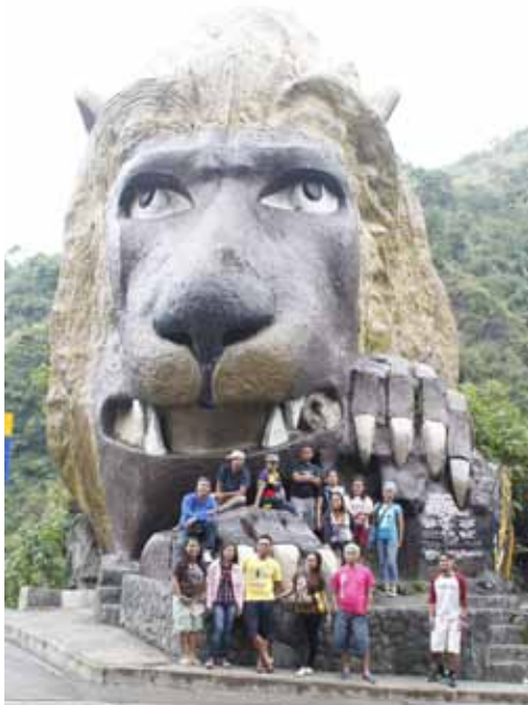
At the famous Lion's Head welcoming visitors to Baguio City.

The Hundred Islands in Alaminos, Pangasinan and Baguio City were the destinations of the CBM and Residential Departments for their own rest/sabbatical. They went first to the Hundred Islands for island hopping and then proceeded to Baguio. They visited most of the famous parks there and spent much time trekking and taking souvenir pictures together. This was from September 11-13, 2014.