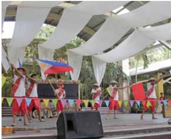
Onesimo boys dance in celebration!