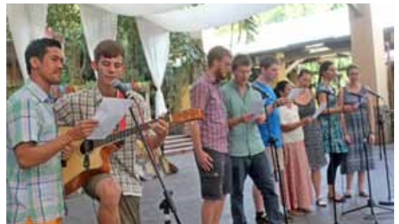
The Discovery Team singing a song in the Filipino language