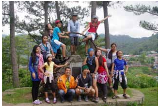
A group picture at Sagada Town