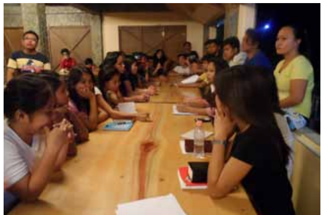
Evening Bible studies