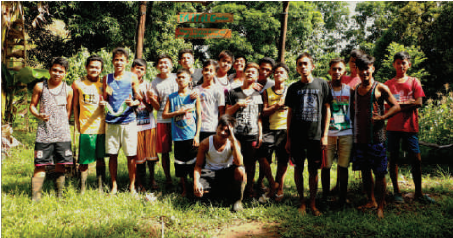
The boys working on farming, cleaning the road and building a half court.

At total of Twenty-One (21) new trainees were admitted to the residential program. They were assigned to their respective centers after the Work Camp.