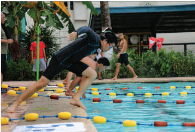
Swimming is one of the most enjoyed sports in Sportsfest