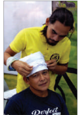
Staff learning different kinds and ways of tying bandage