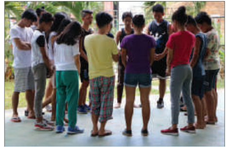
Prayer should be the key of the day and the lock of the night. - George Herbert

"Pray continually." 1 Thess. 5:17 Evangelistic Night, a time to commit our life to our Lord