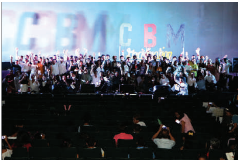
CBM Community Group Picture