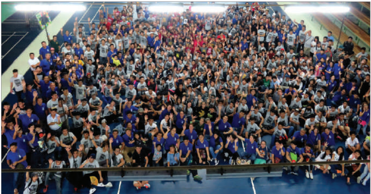
Onesimo Community (August 4, 2017)