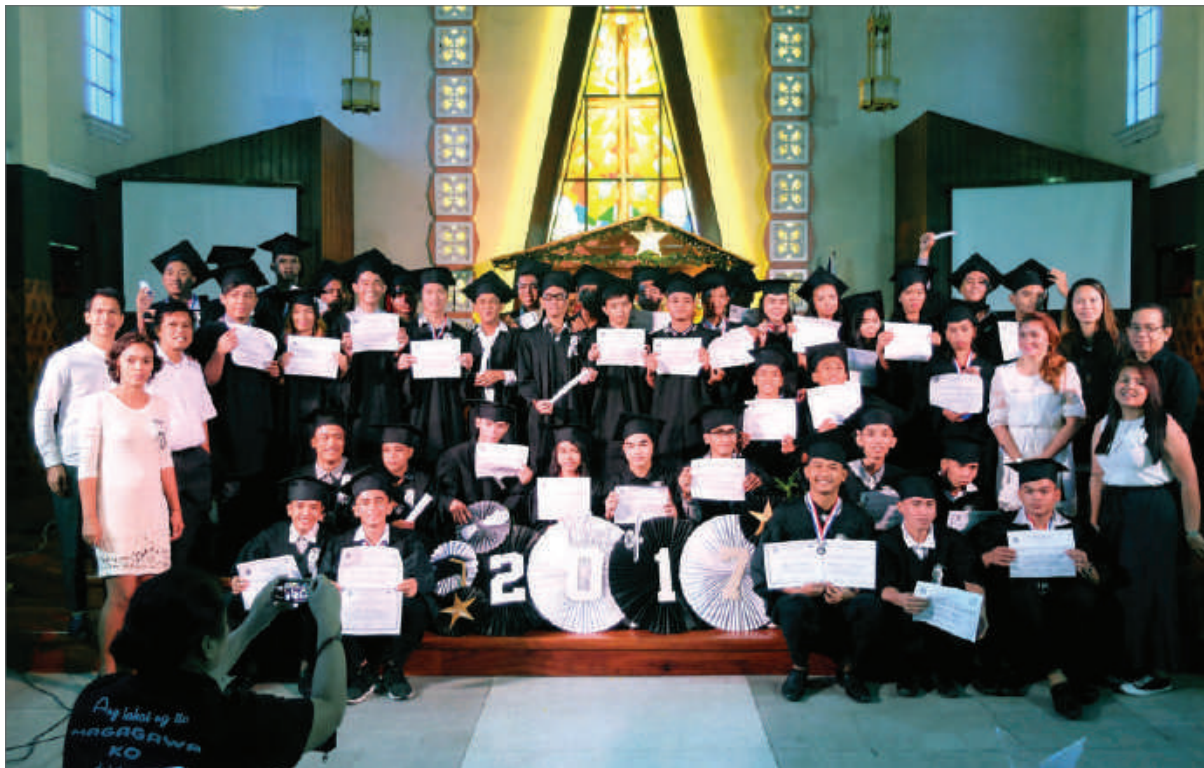
OAEP Teachers together with the CLT and proud graduates of skills training.

We were granted another year to celebrate the mastery of the trainees in skills training. Student trainees attended the commencement ceremony of the Skills Training Program Class 2017 last December 08, 2017. Residential and CBM program skills graduates rejoiced with this trainees and teachers.