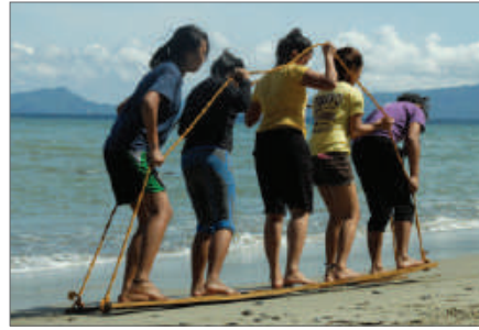
Girls enjoying the games