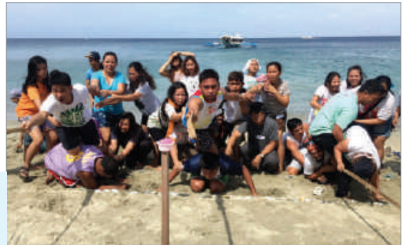
The staff playing at the shore