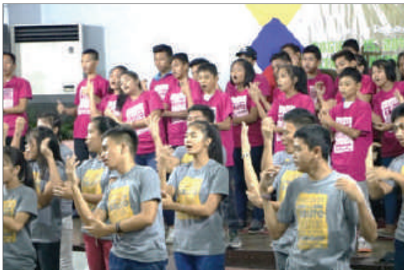
New Trainees' special number with the Kuyas and Ates

They showed their willingness to change and desire to reach their goals through acknowledging that there are people who are willing to help and are willing to be with them as they journey on becoming a better version of themselves.