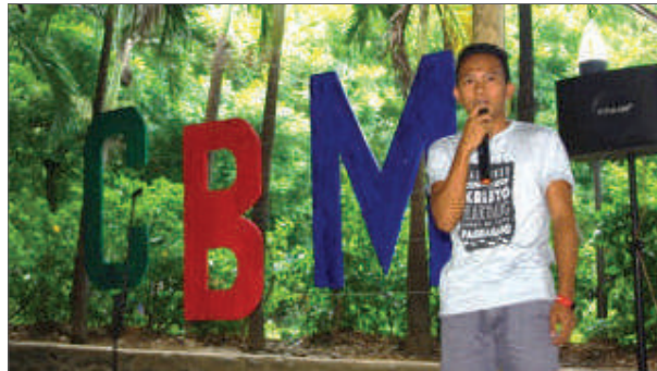
A beneficiary giving testimony