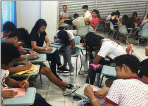
Appreciation is a wonderful thing. It makes what is excellent in others belong to us as well. - Voltaire