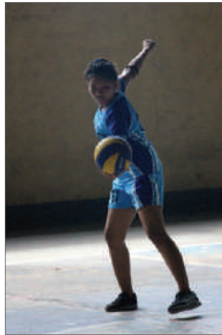
Basketball and Volleyball games