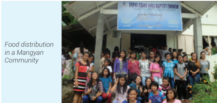
Food distribution in a Mangyan Community