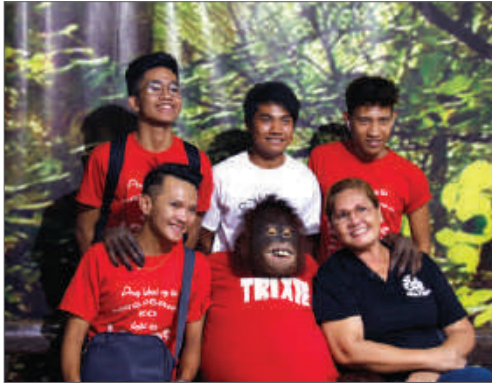
Picture with Trixie the monkey at Avilon Zoo

For this year, we visited Avilon Zoo, Noah's Ark Resort (March 2, 2017) Gardenia Bread Factory and Enchanted Kingdom (August 4, 2017). We can't compensate the feelings and happiness seen from everyone's face. The enjoyment was all real, those genuine smile and laughter are one of the reasons why Onesimo is still reaching out for more youth.