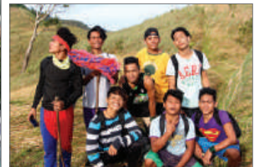
Beneficiaries as they enjoyed the hike in Mt. Malasimbo