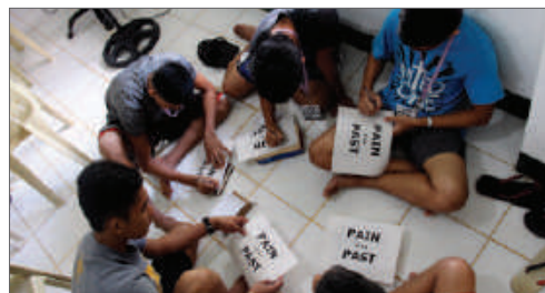
Trainees doing the "Pain of the Past" Activity