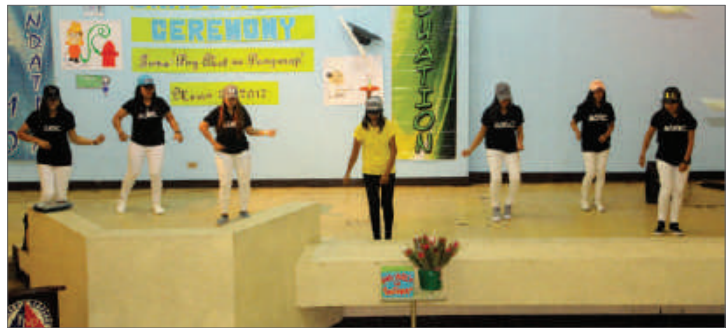
Mendez center's dance presentation