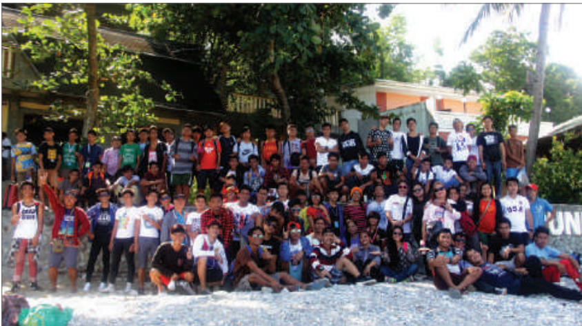
CBM Summer Camp group picture

The first batch was held from March 6 to 10 and the second batch was held from March 13 to 17.