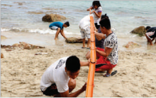
Teamwork is at the heart of great achievement. - John C. Maxwell