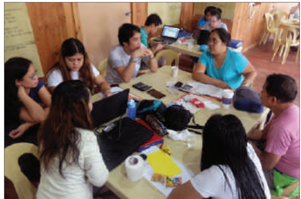
Discussion of activities for 2018