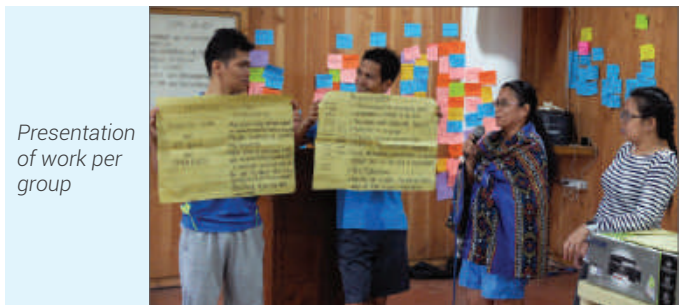
Presentation of work per group