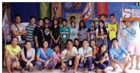
PELT Level 2 Trainees