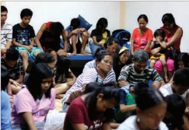
Prayer and contemplation

The second batch was for the newly accepted trainees and their families. There were one hundred twenty nine (129) participants. They spent three days in Camp Rock from November 28 to December 1, 2017 with the staff. They were all first timers and really appreciated the beautiful scenery.