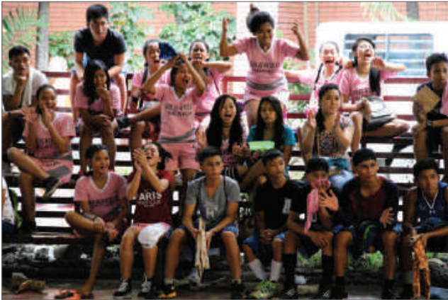
The youth as they cheer for their favorite Basketball team