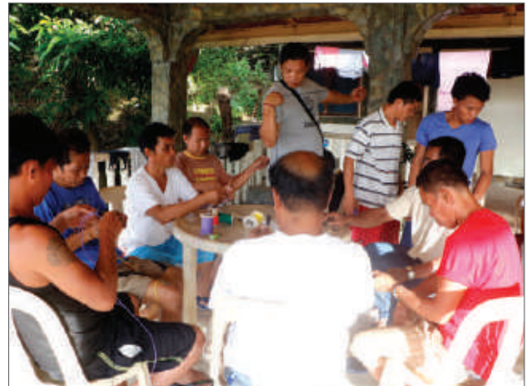
Paracord making with the Tatays

The parents and the trainees had time for simple livelihood projects that encouraged them to put up small business at home. We conducted workshops on how to make liquid soap, perfume, paracord and bead making facilitated by the staff of Onesimo. They also had recreational activities where they played together with the children and swimming time in the beach. These activities help to re-establish good relationship between parents and children.