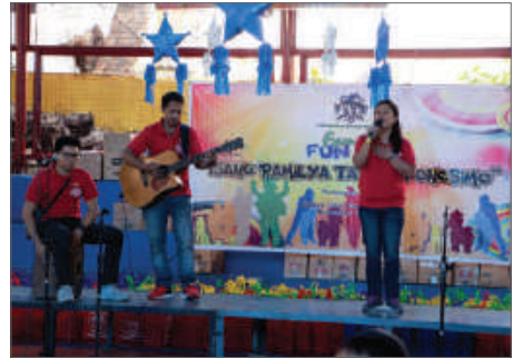
Praise and Worship time before the start of the program