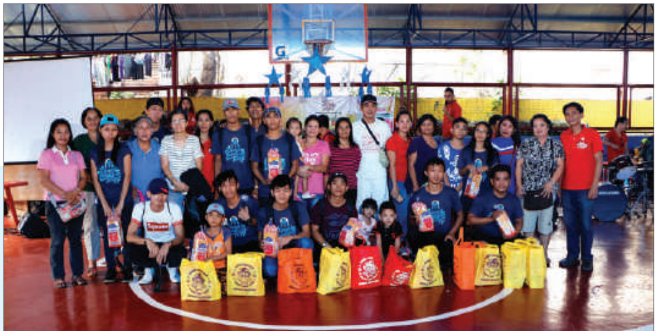
Christmas grocery giving to beneficiaries and their families