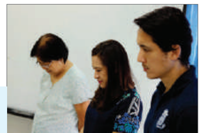
Onesimo members prayed for Vice Mayor Joy Belmonte and Councilor Gian Sotto