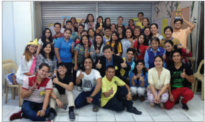
Instructional Managers Group Picture