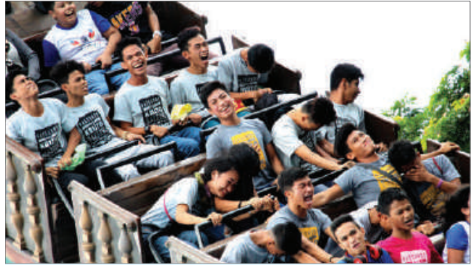
Client's different reactions and facial expressions at Enchanted Kingdom's Anchors Aweigh