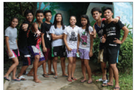
Residential trainees with their Social Workers and volunteers