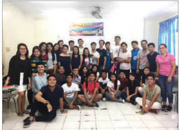
Youth Leaders from JCIS, OBCC, IRM and Onesimo