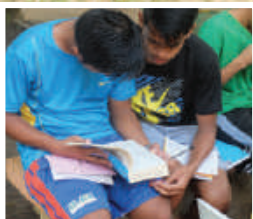
Beneficiaries who participated in the Work Camp, together with the Pastors, Workers and staff.