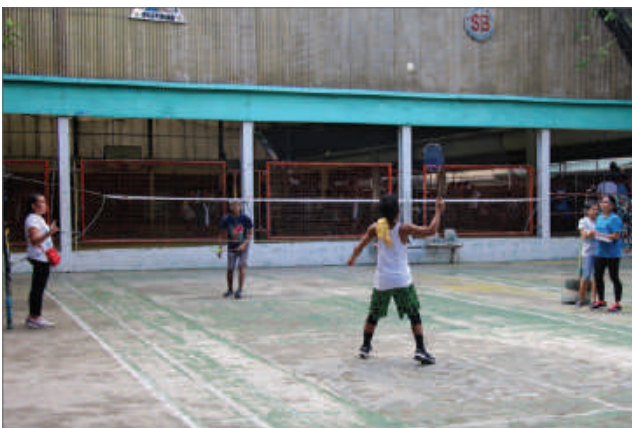
One of the well-loved sports is Badminton