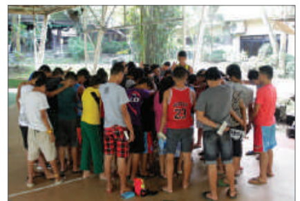
Trainees praying together