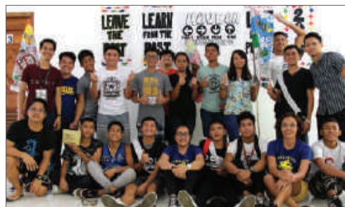
PELT Level 1 new Trainees