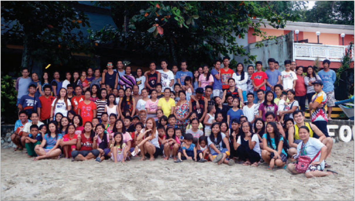
Trainees with their families and staff gather for a picture