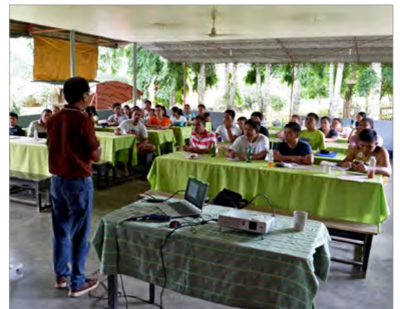
Instruction in organic farming and slope farming techniques from the experts in the Mindanao Baptist Rural Life Center, Davao, Southern Philippines.