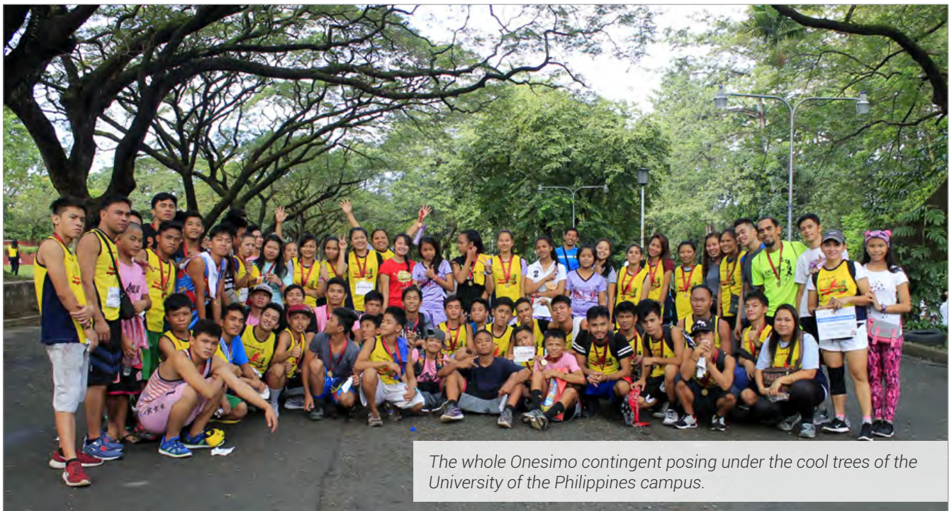
The whole Onesimo contingent posing under the cool trees of the University of the Philippines campus.