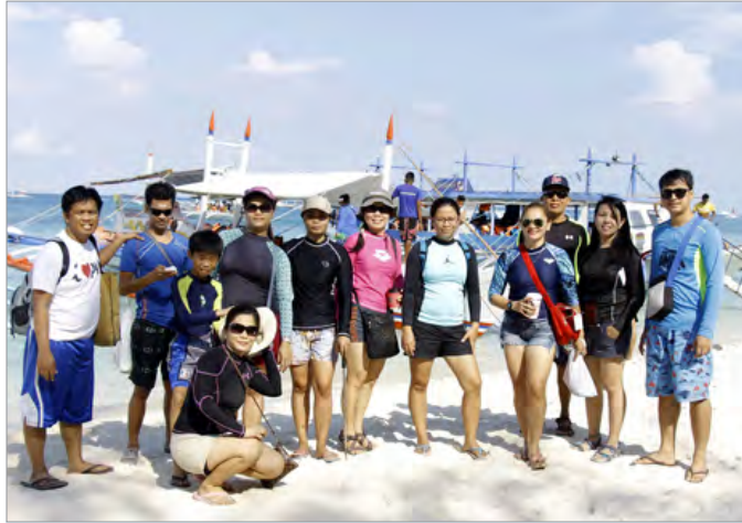
OAEP, MSS and Special Events staff on the beach of Boracay.

OAEP, SPED & MSS on the other hand chose to enjoy their bonding across the waters. They went to Romblon and Boracay Islands (one of the famous beaches in the Philippines) and have enjoyed the different activities across the seas.