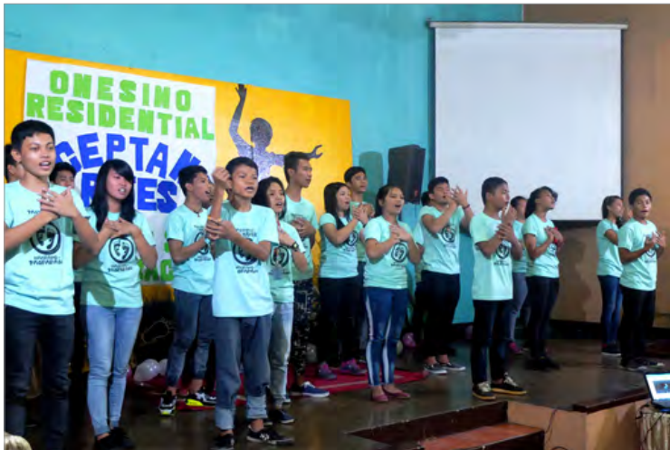
The new trainees expressing their thanks and joy through a song and dance presentation. They are seen wearing their new t-shirt symbolizing their new status as part of the Onesimo Program.

This year, the ceremony was held at Fairview Fundamental Baptist Church on October 4, 2016, which was attended by the relatives to show their support.