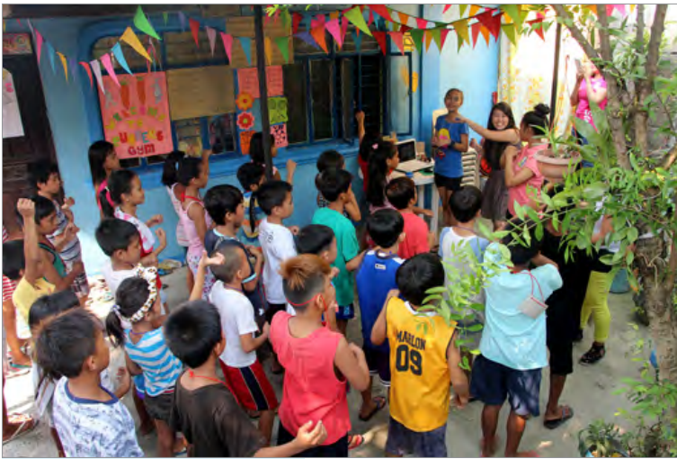
The Bagong Silang Girls leading the elder children in physical activity

The activity is also a training ground for the clients to improve their skills in communication and relationship with the children within their communities. These also serve to show that Onesimo can be beneficial to the community.