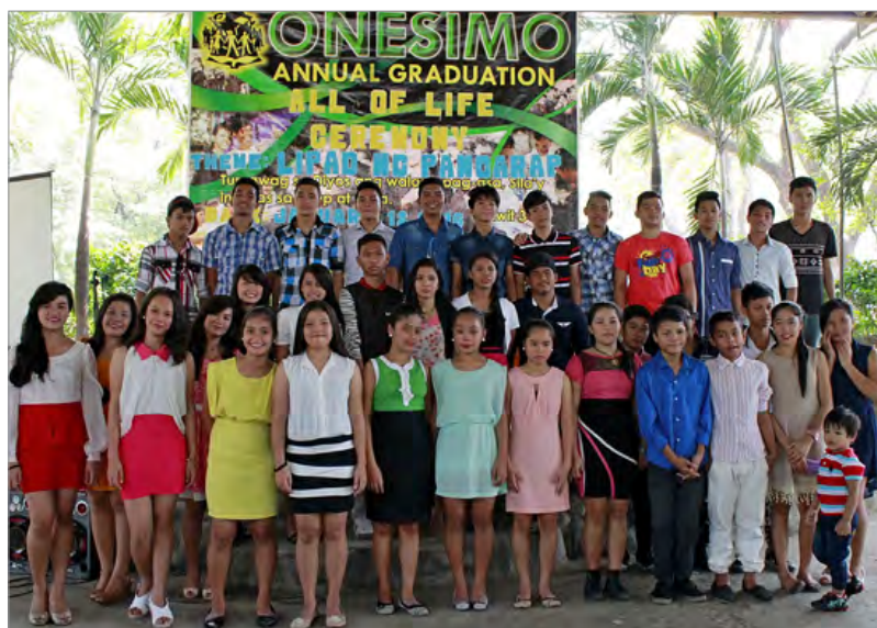
The current batch of Trainees pose for their souvenir group photo.

It is a reminder that we can reach our goals if we continue to dream and do something for us to be able to achieve our dreams.