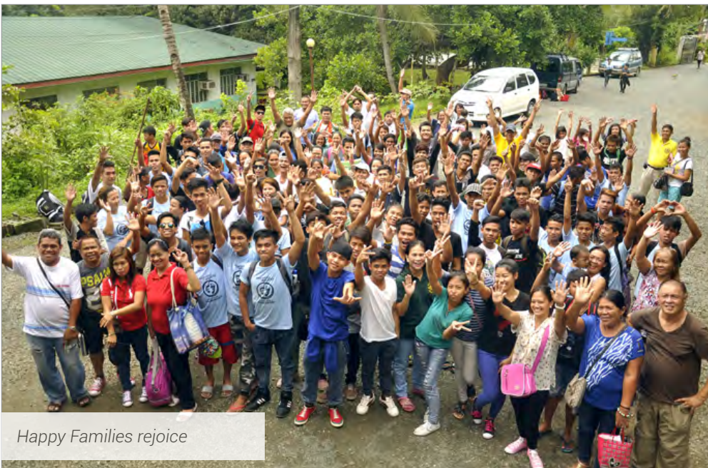
Happy Families rejoice

Family Retreat is an annual event of Onesimo CBM that offers a haven for special needs of families. Here, families are cared for, encouraged, and rejuvenated in a fully accessible camp environment. It also offers fun, age-appropriate activities and cultivates meaningful connections with families who understand the challenges of life with disability. It is also a special time of spiritual refreshment for the whole family. It has two batches; the first took place on October 11-13 and the 2nd on October 19-21 at Methodist Prayer Garden and Conference Site, Brgy. Dolores, Taytay, Rizal