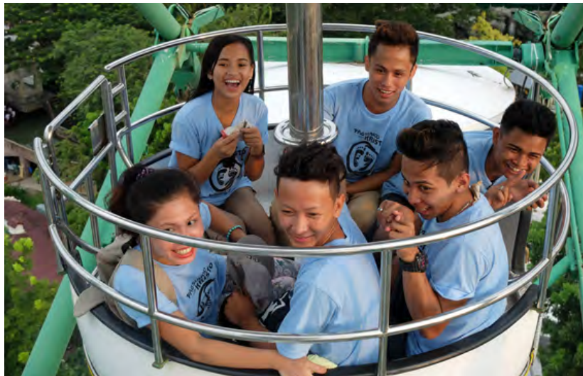
CBM beneficiaries enjoying the Ferris Wheel at the Enchanted Kingdom