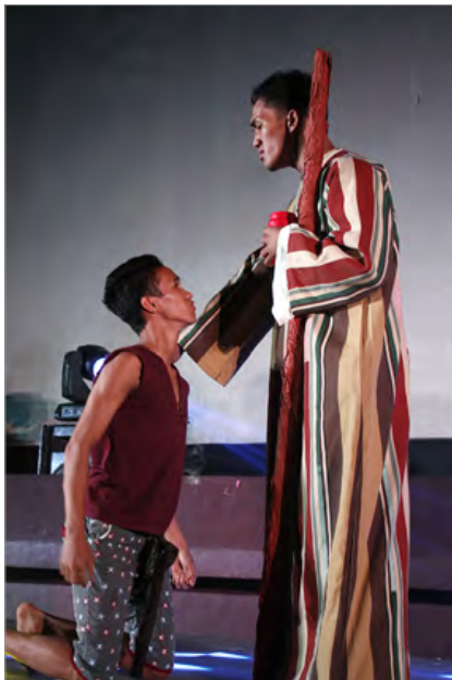
The prophet Samuel anointing the young David

The program closed with a dance number by the staff and residential clients.