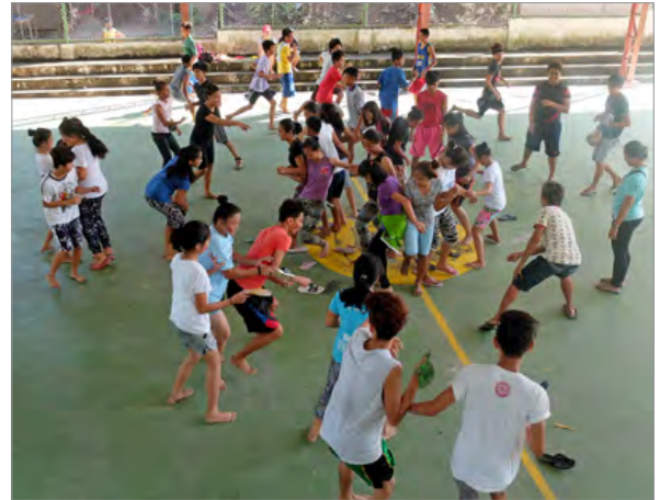
A scene from the “War Game”, a staple game of the Summer Youth Camp. This game teaches many life values.

This year, the Camp Theme was KAMAO— Katropang Ating Maaasahan Anomang Oras (Friends We Can Rely On Any Time). It is about finding the right “ barkada ” for you. As youth approach their teenage years they always want to belong to a “ barkada ” or peer group where they can be accepted. Although most parents advise against engaging in “ barkada ” still, most youth find their own way to belong to a group. We help by showing them the right “ barkada ” or peers that they could choose. Friends to help them grow and learn to dream. Friends that would have a good influence to them and they too can be a good influence to their friends. We want them to believe that we can lean on that ONE FRIEND anytime. Just like Jesus, whom we could depend on and trust with our life.