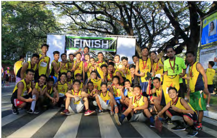
Proud finishers displaying their medals.