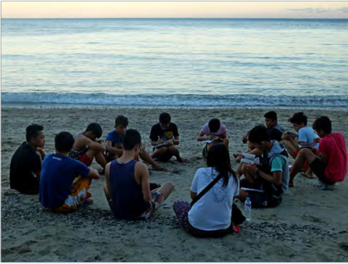
The youth have their Bible devotions in the early dawn