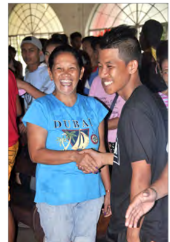
Strained and broken relationships between parents and children are often repaired during the family retreats.