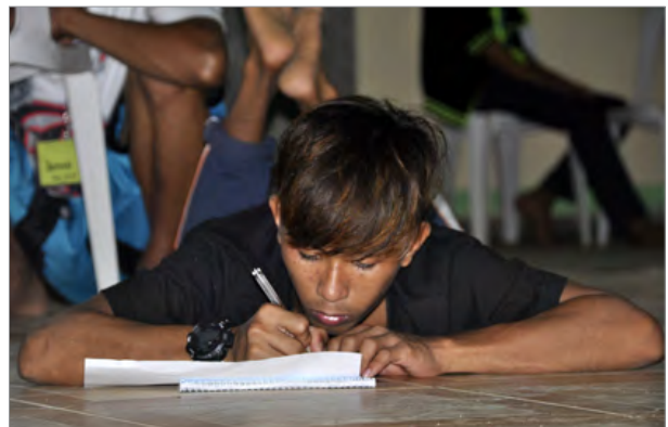
The work camp provides a combination of mental and physical activities.