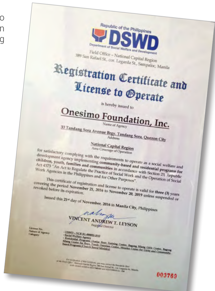
Onesimo Foundation's DSWD Registration Certificate and License to Operate.

On November 21, 2016, DSWD awarded to Onesimo Foundation its long awaited Registration Certificate and License to Operate after complying all the requirements needed.