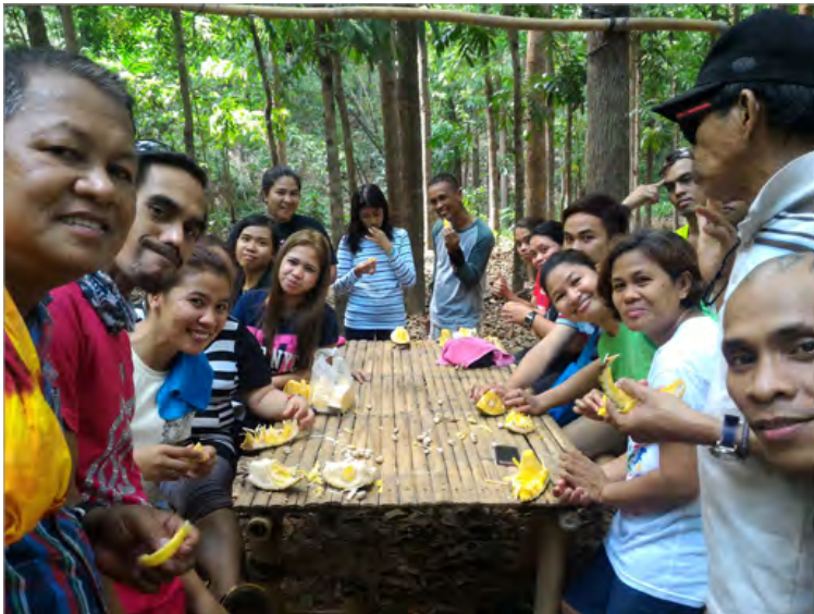
Fellowship in the wooded area of one of the watersheds in the Greater Manila Area, the Wawa Dam in Rodriguez.

This year, we started to have a 3-day Workers' Retreat that took place at Canaan Christian Campsite, Sta. Maria Laguna. A part of our appreciation to them and its purpose is – to remind them that they're always making a difference, and their passion in this ministry connects to the mission of their Church and building of God's Kingdom.