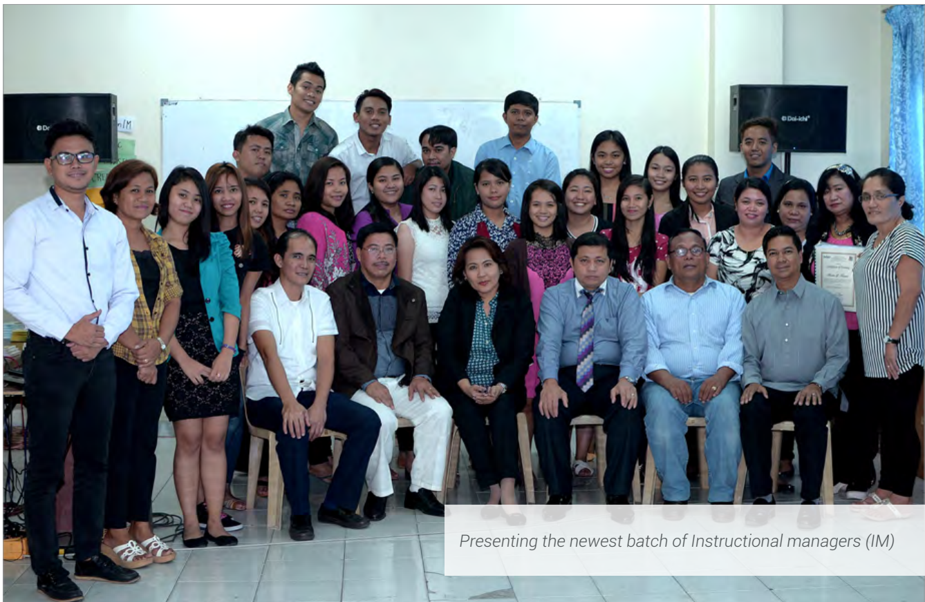
Presenting the newest batch of Instructional managers (IM)