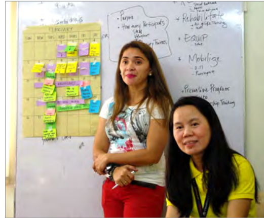
Ate Hazel and Ate Rose oversee the consolidation of the individual departments' plans