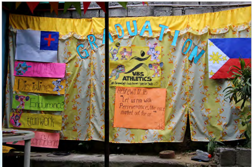
The stage is testimony to the Onesimo clients' art and hard work. The DVBS theme came from St. Paul's letter to Timothy.