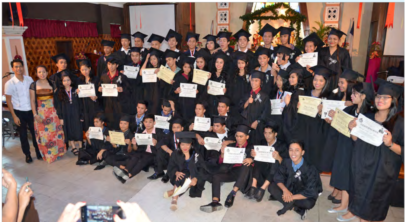
OAEP teachers present the current crop of Skills Training Graduates as they proudly show off their Certificates of Completion.