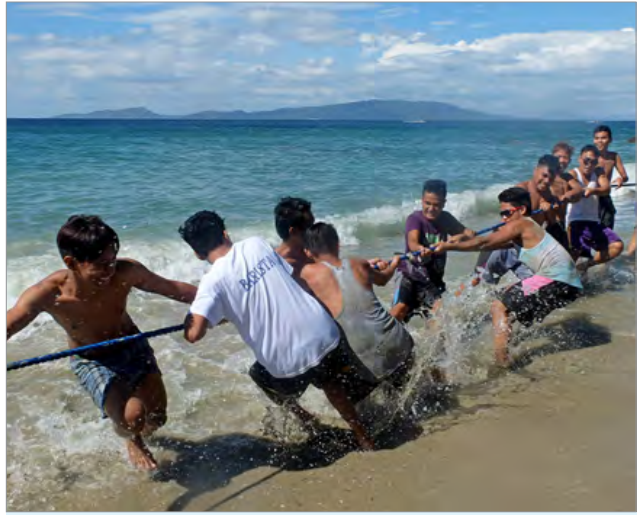
Games and fun on the seashore.