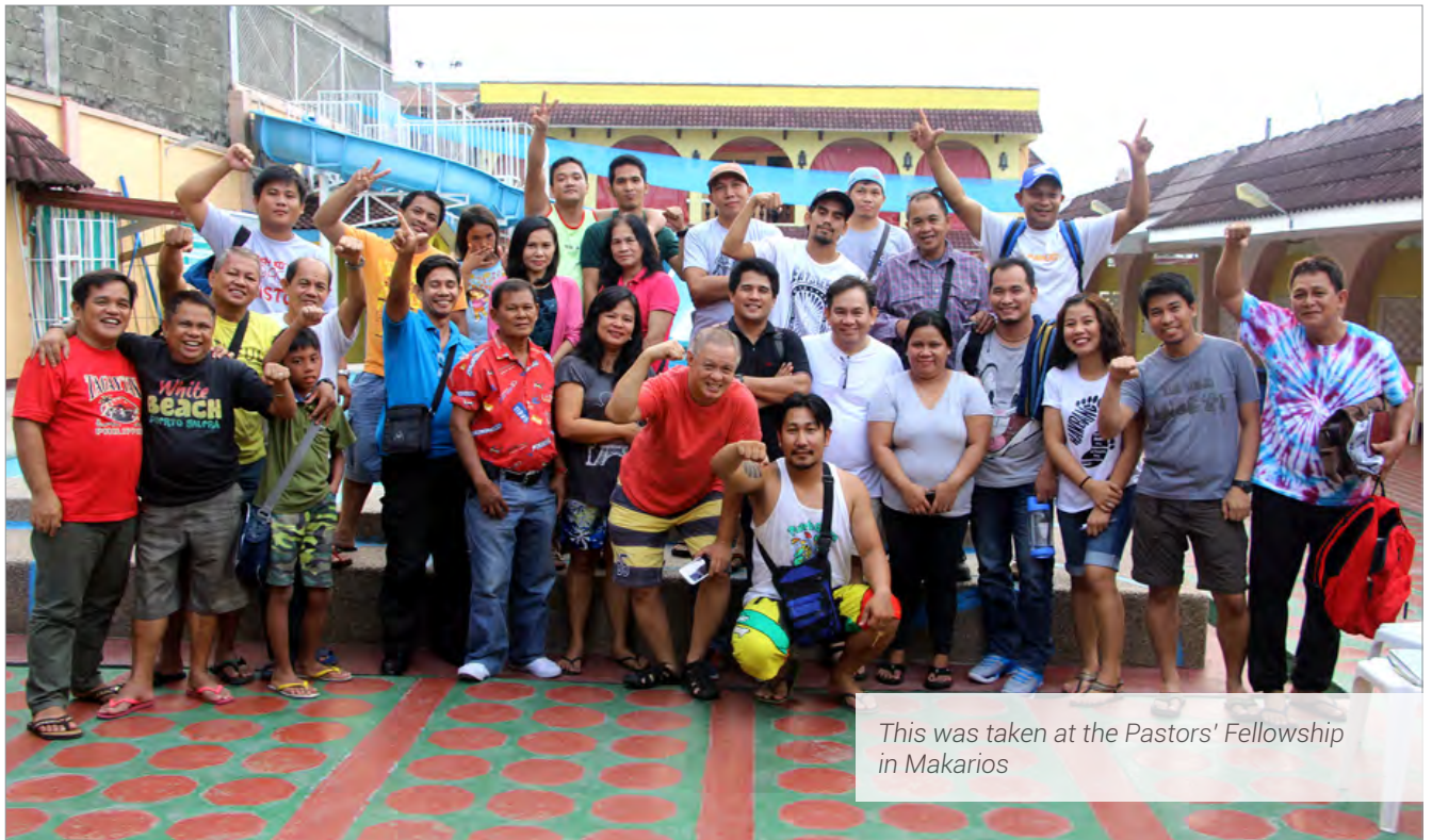
This was taken at the Pastors' Fellowship in Makarios

No matter how busy the Pastors are, when it comes to the schedule of Pastors Fellowship they always give time to attend this event. It provides strength and always a chance to learn and grow in ministry. They all have bad moments in the 2 year course of the program but still they manage to be an encouragement to each other. Sharing their experiences in handling the youth and their strategies in facilitating the whole program, It is also a way to release the burdens and impart some lessons to their co-implementers. This event is not just a way to express that burden but also a way for Pastors to show their funny, entertaining and witty side like an ordinary person where they can laugh out loud, eat like a king, and play like a child.