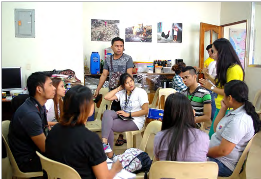
The residential department usually have many activities to lay down and thresh out schedules.