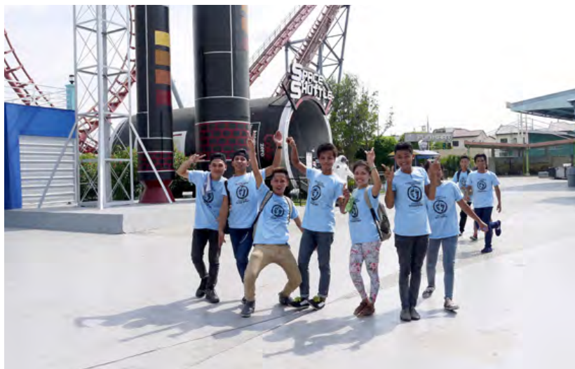
Overjoyed at the opportunity to experience the theme park