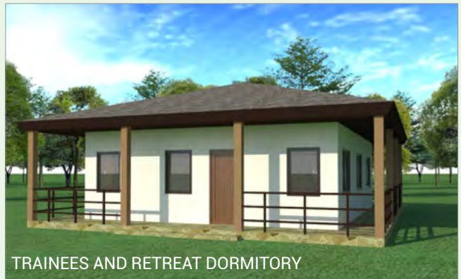
TRAINEES AND RETREAT DORMITORY