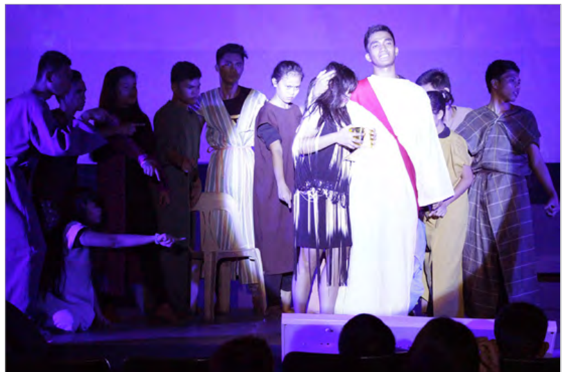
Jesus affirming the gift of the woman amid the condemnation of the crowd.