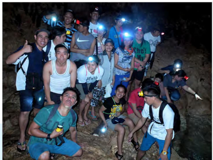
Mount Daraitan in Tanay, Rizal province. The Youth workers trek in the early morning to welcome the sunrise at the peak.