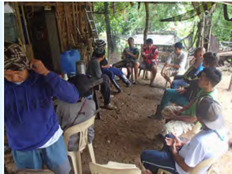
The farm staff introduces and trains visitors in the work and goals of the Farm