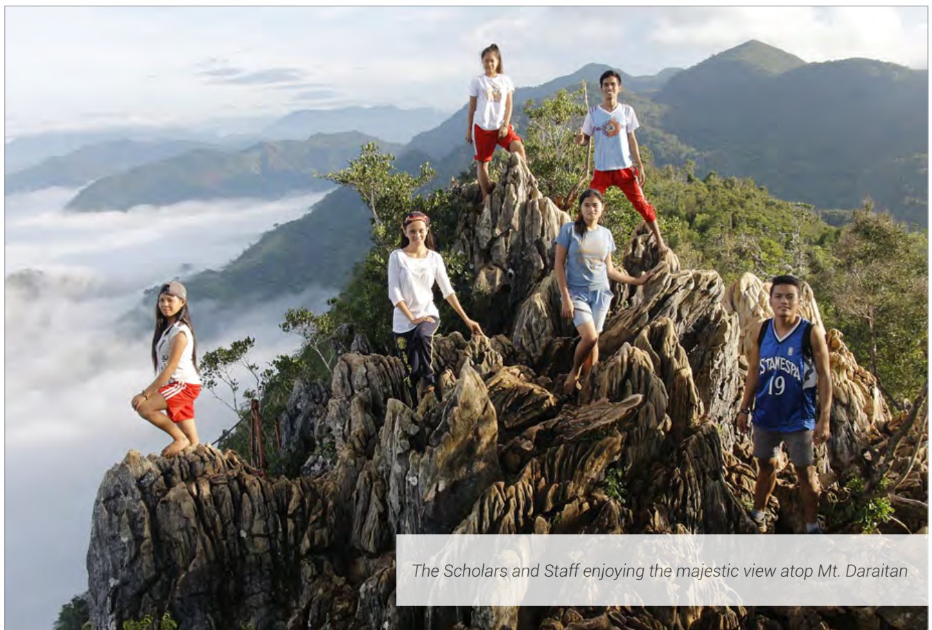
The Scholars and Staff enjoying the majestic view atop Mt. Daraitan

The 6 scholars and 5 staff went up to Mt. Daraitan after their stay in Tinipik camping ground as part of their annual Retreat. Early in the morning they started climbing and they reached the peak of the mountain early. They saw the beautiful "sea of clouds". It was an awesome experience for them, enjoyed and appreciated the beauty of God's creation.