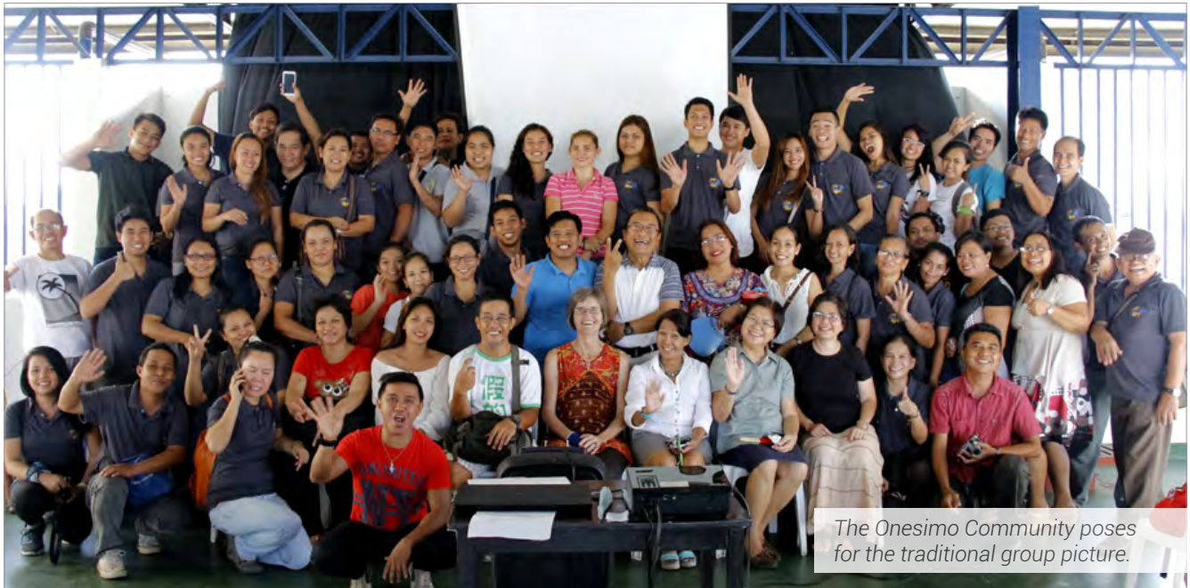
The Onesimo Community poses for the traditional group picture.