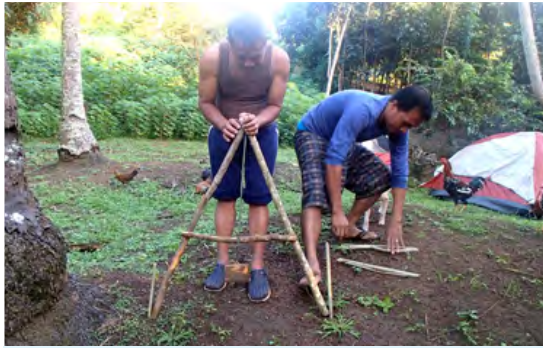
Using the A-Frame tool to plot contour lines in mountain farming