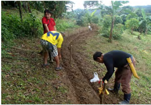
Starting to plant along contour lines to impede erosion using leguminous plants also useful for goat feed.