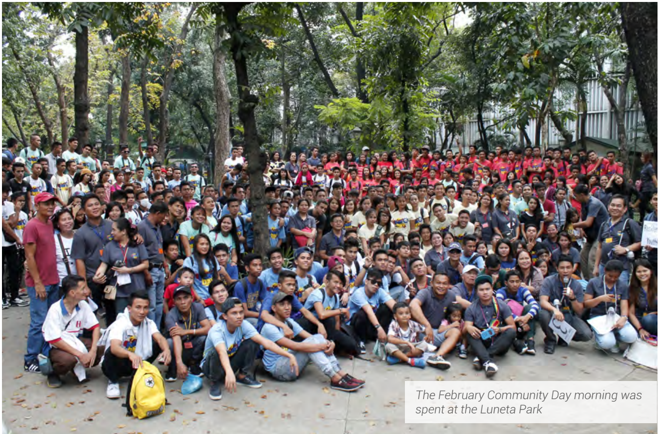
The February Community Day morning was spent at the Luneta Park