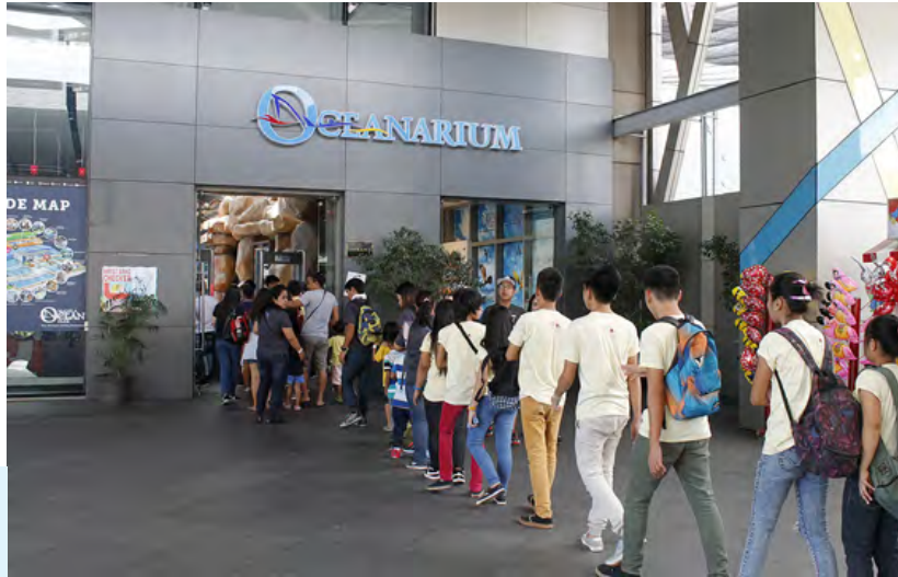
Entering the Manila Ocean Park in the afternoon.