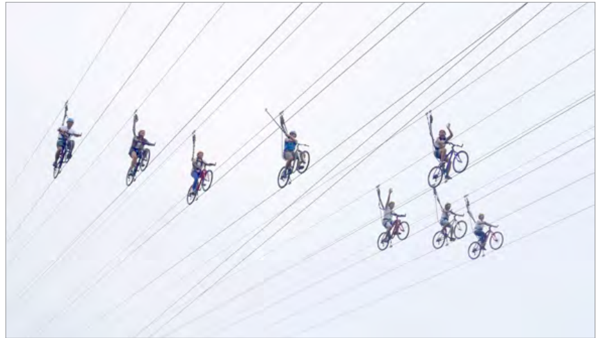
Sky Cycling at Eden Nature Park, Davao

In the evening, the staff roamed and shopped around.