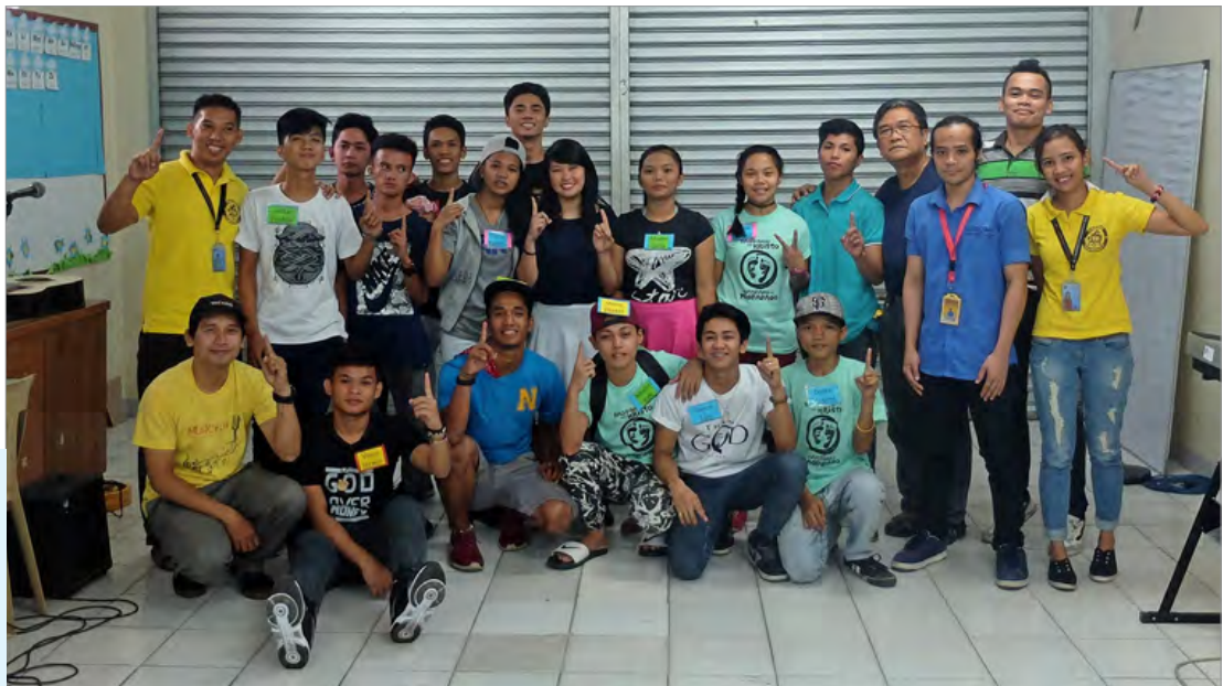
The clients who auditioned with the Music First instructors who came to evaluate their artistic efforts.

The scholars have been going to the Music First for training in their selected art.