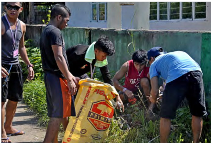
Here the beneficiaries clean up the surroundings in Barangay Coralan in Sta. Maria, Laguna.

This year has the largest number of churches who participated in the annual Onesimo CBM Work Camp. It is the 5th year of Work Camp participated by 16 churches with their respective outreached youth-at-risk. Among all activities, it is the most exciting of all yet the most crucial in Onesimo Church Based Ministry's attempt to intervene in the lives of Philippines' urban poor youth. It is a 5-day sheltered camp that includes different workshop, recreational and physical activities that help them detoxify and divert from their usual activities in the streets. Two batches of work camps were held at the Canaan Christian Campsite at Sta. Maria, Laguna on June 8-13, 2016 and July 11-16, 2016.