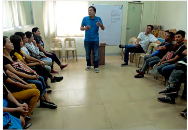
Stress debriefing seminar for youth workers held at the Onesimo Conference Room