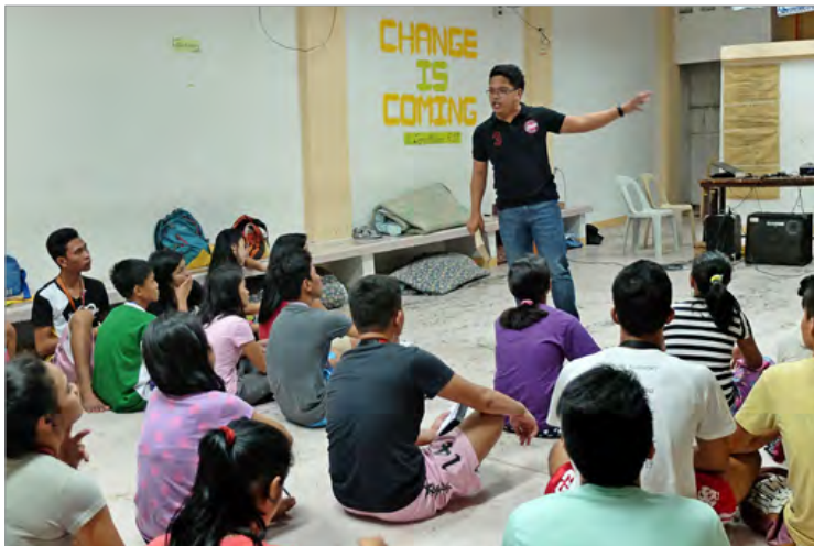
The PELT retreat always includes Instruction and Nature components

Number of students who completed the training; 4 Basic Literacy Students, 7 Elementary Students and 12 Secondary Students. A total of 23 students who underwent a half year training and were able to reach the final stage for Level 1.