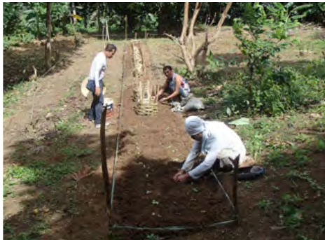
Modelling of home farming technology called FAITH garden which will allow a family to grow enough vegetables for sustenance in a 100sqm lot.