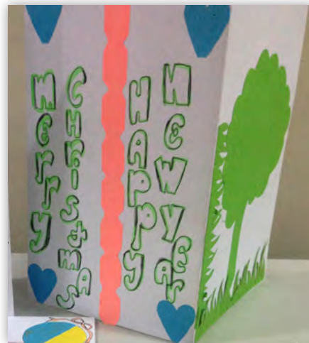
Some of the cards created by the clients to be sent to their sponsors