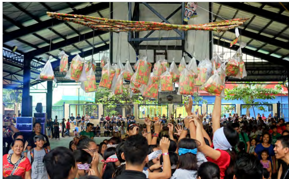
The traditional Filipino game of Pabitin, where packages of goodies are suspended from a bamboo lattice which is pulled up and down, while participants jump up to grab their gifts.