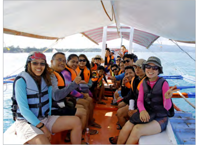
Island hopping with snorkelling and swimming