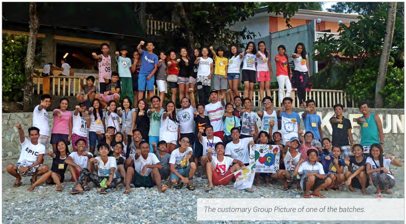
The customary Group Picture of one of the batches.